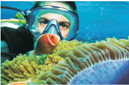
Great Barrier Reef