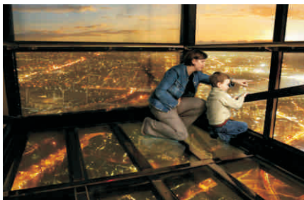
Eureka Skydeck 88