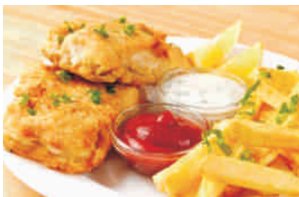
Fish and Chips